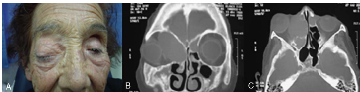
Figure 1 (A) Face of an 85-year-old woman, with a history of 5 years of holocranial headache and ocular protrusion with loss of vision; (B) CT scan of the paranasal sinuses, coronal section; and (C) axial section, showing bilateral fronto-ethmoidal mucocele, larger on the right side, with ocular protrusion and compression of adjacent structures.

Endoscopic mucocele management has the advantage of allowing a less traumatic approach, as well as reducing morbidity rates and operative time to a minimum. Therefore, endoscopic surgery is becoming the surgical technique of choice. All procedures were performed according to institutional bioethics norms.